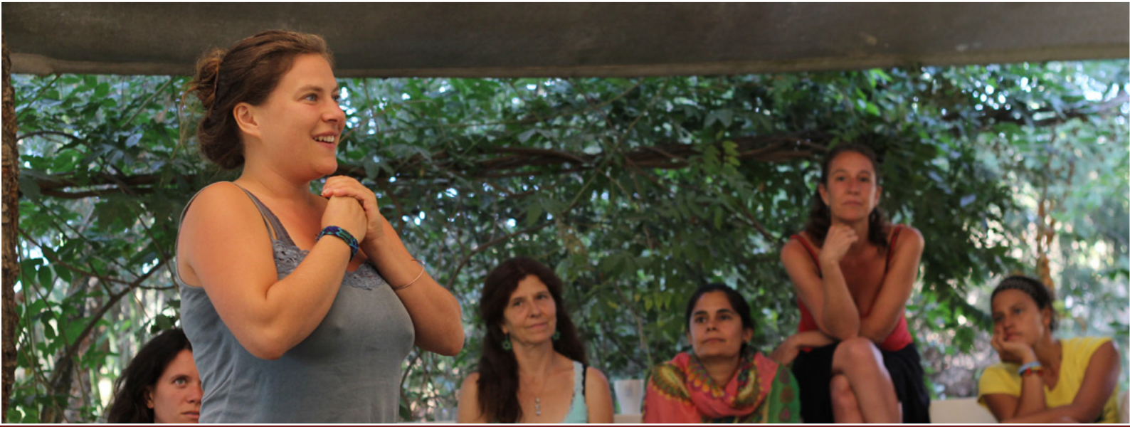
Sharing in our forum work