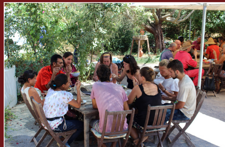
Meals at the Solar Village