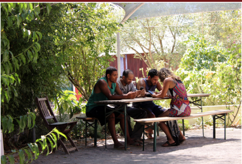
Staying connected to our own projects during this time