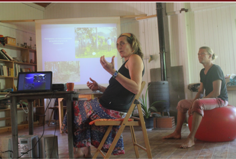
The Mexican Group presenting their project and receiving consultation from Tamera experts