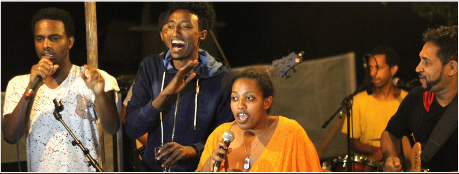
Ethiopian participants of the Terra Nova School sing together with Poesia Samba Soul