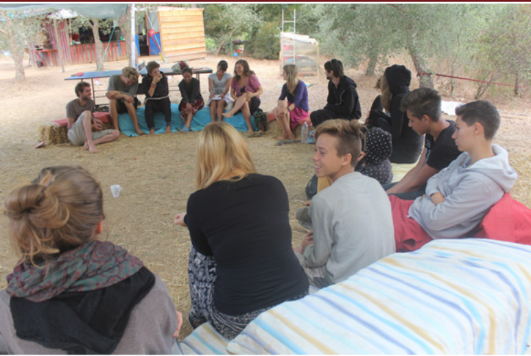
Representatives of every base station presented in the Youth Camp that took place in Tamera at the same time