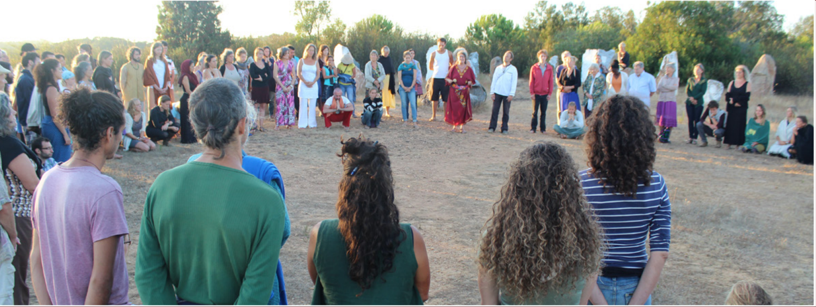
Opening ceremony in the Stone Circle